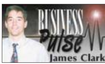
I won't bend my ethical standards.

As for other news, summer is around the corner which means it's time to start thinking about baseball and amusement parks. For the past gazillion years, we've gone to Dollywood and I was thinking it would be great if Tennessee had another big-time amusement park.