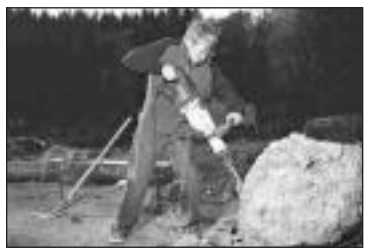
At the man park in Germany, you can operate a jackhammer or a backhoe.

Granted, steroids might allow me to type a few more words a minute, and they might make my brain even bigger to store more business information, but