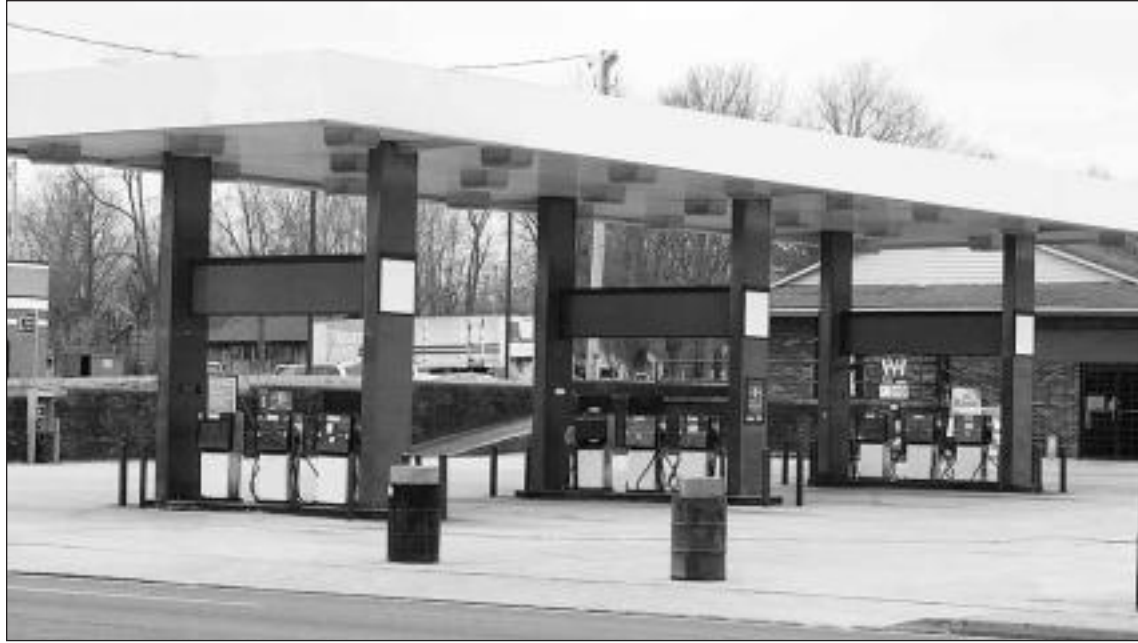
There are barrels by the entrance of Pit Stop closed. It is one of four stations owned by Sid North on Chancery Street and the gas station is closed. It is one of four stations owned by Sid Stanton that was shut down last week.